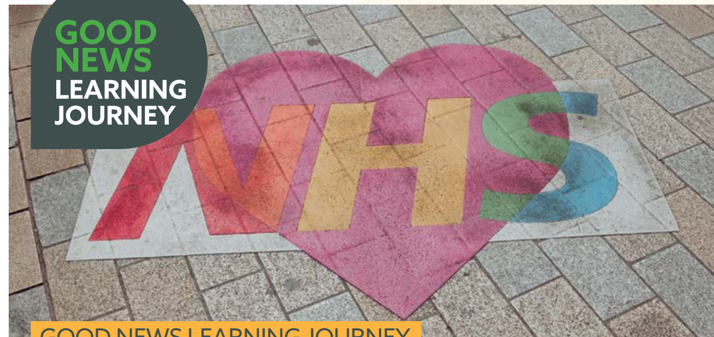
GOOD NEWS LEARNING JOURNEY